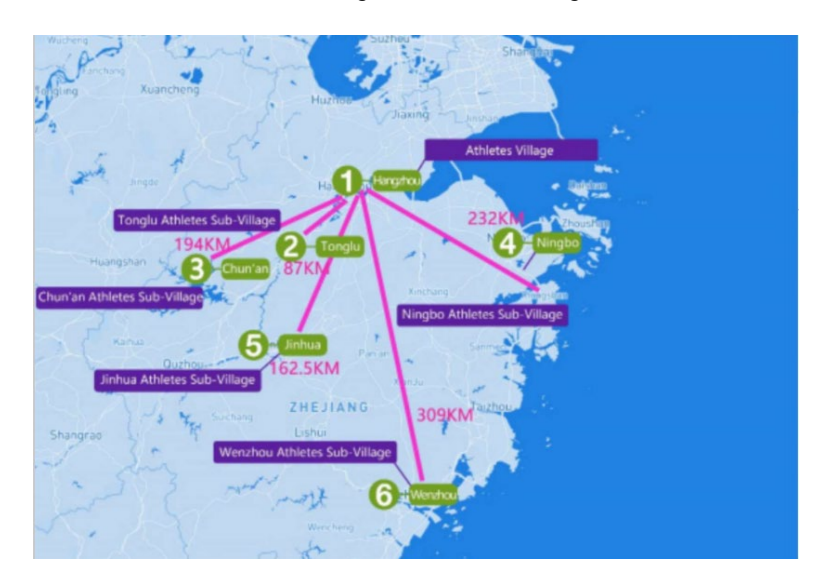
Location of the Athlete village, the five sub-villages and distances

The Asian Games are recognized as one of the largest major sporting events in the world and its 19<sup>th</sup> edition certainly lived up to this reputation, with almost 12,000 participating athletes representing 45 Asian delegations. The Asian Games 2022 took place in Hangzhou, China, were officially opened on 23 September 2023 and concluded on 8 October 2023. The Asian Games 2022 featured 40 sports, 61 disciplines and 481 medal events. The Asian Games 2022 were spread across a large geographical zone, which included 55 competition venues, the Athlete Village in Hangzhou, as well as five athlete sub-villages where specific sports/disciplines took place in Ningbo, Wenzhou, Jinhua, Tonglu and Chun'an.