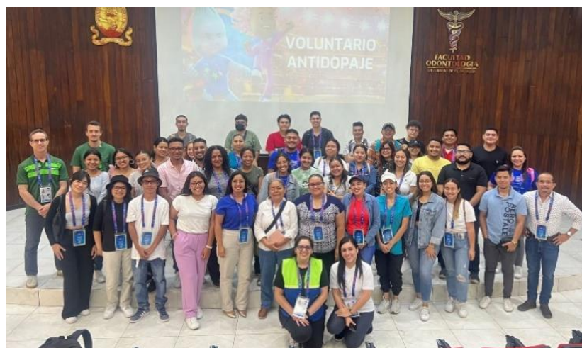
Chaperone education session for local volunteers prior to the event