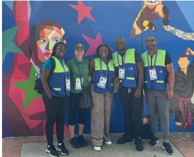
Caribbean RADO DCOs and staff and WADA representatives at the Games