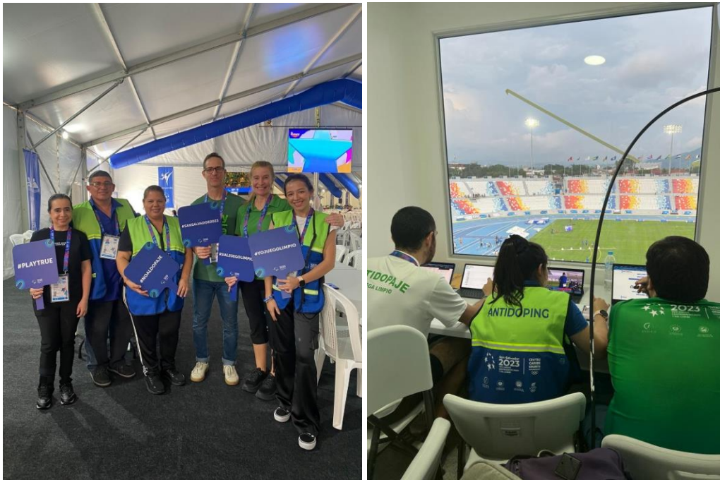
At left, education officials and WADA representatives in the central booth; at right, doping control officers in the control tower gathering information at the Games venue during the athletics competitions.