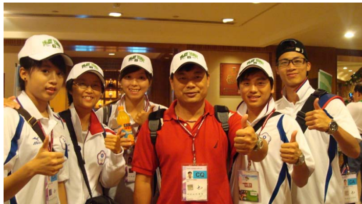
Athletes visiting the WADA Outreach Center at the World Games. Chinese Taipei Team (Above)

The Regional Office coordinated the participation of DCOs from China Anti-Doping Agency (CHINADA), Japan Anti-Doping Agency (JADA), Korea Anti-Doping Agency (KADA), Malaysia Anti-Doping Agency (ADAMAS) and the Singapore NADO to support the sample collection during the Games. The participation of these DCOs was highly appreciated by the Organizing Committee and was an excellent example of the regional cooperation for anti-doping development.