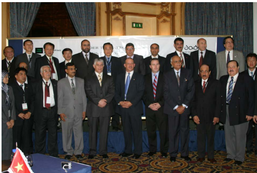
Officials from 20 countries participating at the 6 th Asian Region Intergovernmental Meeting in Amman, Jordan.

All presentation documents, background papers and the meeting resolution are available from the WADA Regional Office.