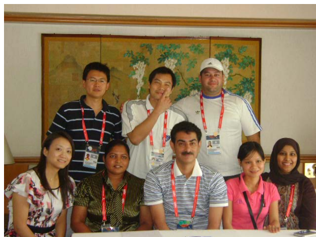
International DCOs from 5 Asian RADOs and CHI NADA joined the SAYGOC Doping Control Team.

The Regional Office also coordinated, at the request of the SAYGOC, the participation of JADA DCOs.